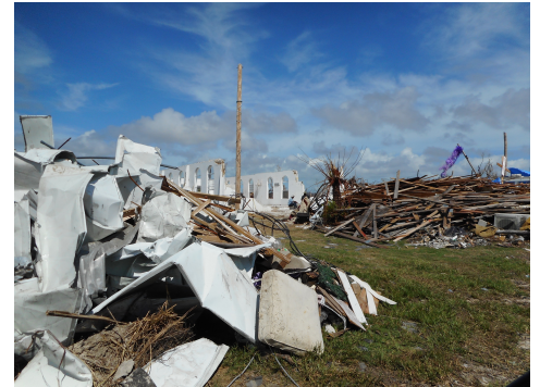
Marsh Harbour Abaco was totally destroyed OWB deployed 5 teams to Grand Bahamas post Hurricane Dorian