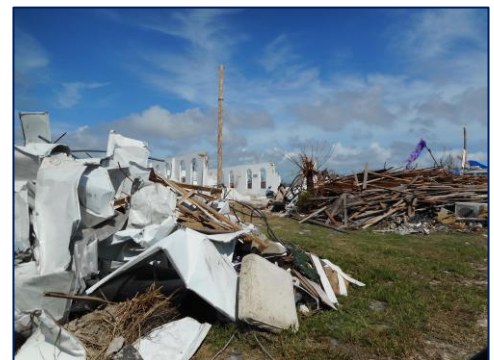
Marsh Harbour Abaco was totally destroyed. OWB deployed 5 teams to Grand Bahamas post Hurricane Dorian