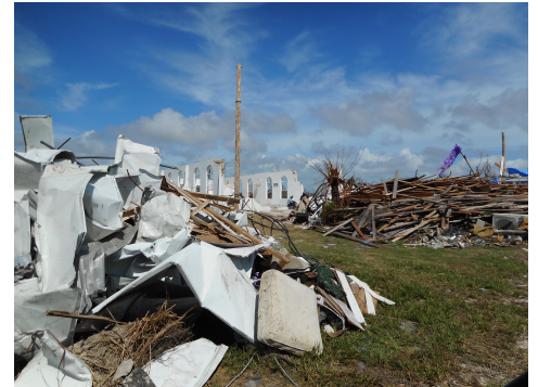
Figure 1 Marsh Harbour Abaco was totally destroyed OWB deployed 5 teams to Grand Bahamas post Hurricane Dorian